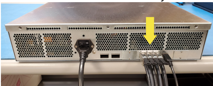
SBExpress-RM5 NVMe SSD Test System populated with cables