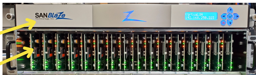
SBExpress-RM5 Dual Port NVMe SSD Test System