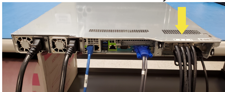
Gen5 Host System populated with cables