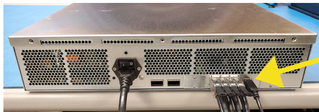
SBExpress-RM5 USB port for connecting to server