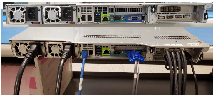
SANBlaze NVMe Gen5 Host System

If you are using a SANBlaze host system, the adapters will already be installed for you and you can skip to Step 3. To install the adapter(s) in your own host system, see the figures below for a sample installation of a SANBlaze host system for Gen5 to guide you for your own installation.